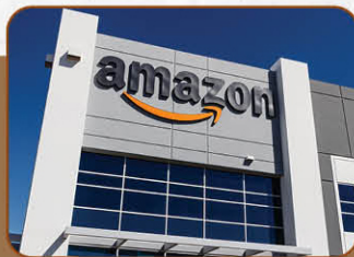
Amazon Data Center