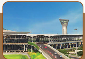
Hyderabad Intl. Airport