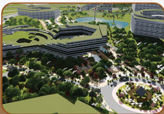
Hyderabad Pharma City