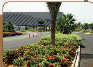
TCS - Adibatla